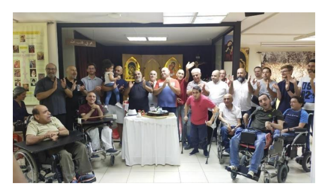
On Father's Day , June 21, all Anta Akhi's dads gathered for a Father's Day mass, and celebrated joyfully over a delicious cake baked by our dear Maha! Happy Father's Day!