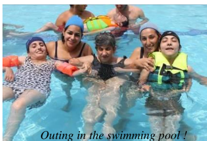
Outing in the swimming pool!

has plenty of small and big festivals in various areas. Anta Akhi decided to have its own festival and join other countries in the world renowned for the festivals: France Cannes, Italy Venice, Brazil Rio de Janeiro, and India.