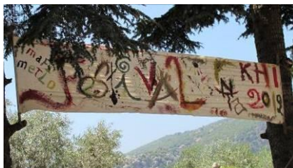
Concert in the presence of the well-known Lebanese singer, Carole Samaha

"The festival of Anta Akhi" was the selected theme. In summer time, Lebanon