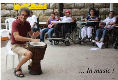
... In music !