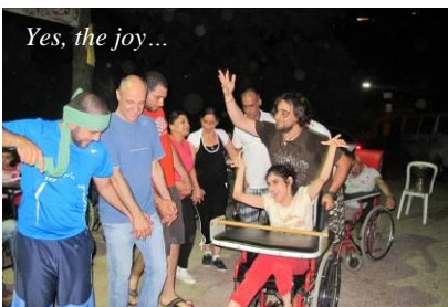
Yes, the joy...