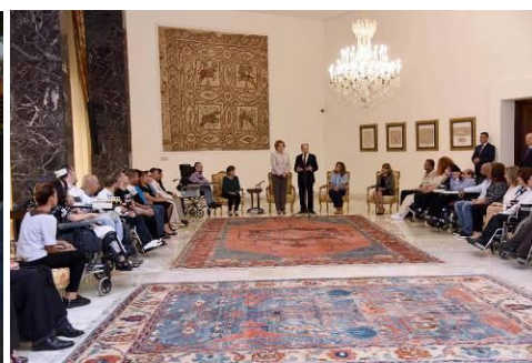
Visiting the Presidential Palace

Our young adults suffering from disability are waiting you to share together the joy of Christmas