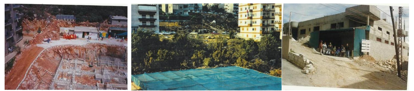
Stages of construction of the "Home of Tenderness" - Anta \overline{Akh} year after year

To accompany the church community and, through it, the civil society, means to change the way people look at the persons with disability, and make each one realize that he is concerned by the life of these persons and their families. We notice how much the Church and the civil society can, by their status, their behavior, their education, their values, and their orientations, increase or ease the problems of the persons with disabilities and their families.